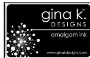
Gina K Designs OBSIDIAN Amalgam Ink...