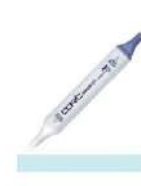
Copic Sketch Marker BG13 MINT GREEN...