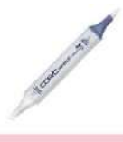
Copic Sketch Marker RV13 TENDER PINK...