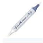
Copic Sketch Marker C00 COOL GRAY at...