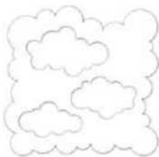
Simon Says Stamp Stencils CLOUDS FOR...