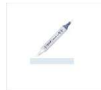
Copic Sketch Marker C1 COOL GRAY Grey...