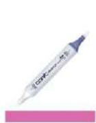
Copic Sketch MARKER RV19 RED VIOLET...