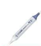
Copic Sketch Marker RV14 BEGONIA PINK...