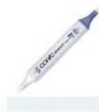
Copic Sketch MARKER C0 COOL GRAY NO....