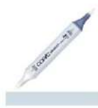
Copic Sketch MARKER C2 COOL GRAY NO. 2