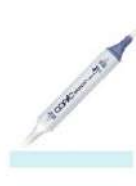
Copic Sketch Marker BG11 MOON WHITE...