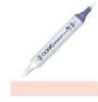
Copic Sketch Marker R20 BLUSH Pink...