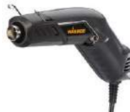
NEW 2020 Wagner Precision Heat Tool...