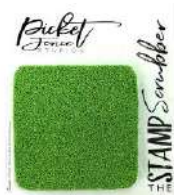
Picket Fence Studios THE STAMP...