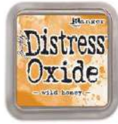
Tim Holtz Distress Oxide Ink Pad WILD...