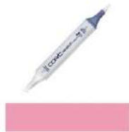
Copic Sketch Marker R83 ROSE MIST...