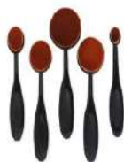
Set of 5 BLENDER BRUSHES Mixed Sizes...