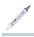
Copic Sketch MARKER C3 COOL GRAY Grey...