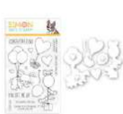
Simon Says Stamps And Dies LIFTING...

Here are the supplies used. Where available I use Compensated Affiliate Links , which means if you make a purchase through my link, I receive a small commission at no extra cost to you. Thank you so very much for your support, I truly appreciate it.