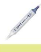
Copic Sketch Marker YG23 NEW LEAF...