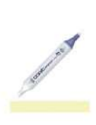
Copic Sketch Marker YG21 ANISE Yellow...