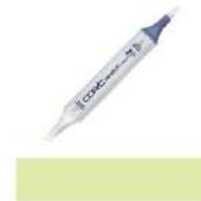
Copic Sketch Marker YG03 YELLOW GREEN...