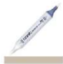
Copic Sketch Marker E44 CLAY Dark...