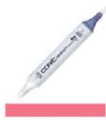
Copic Sketch Marker R35 CORAL at...