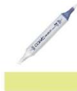
Copic Sketch Marker YG23 NEW LEAF...