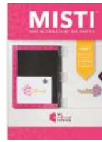
MISTI PRECISION STAMPER Stamping Tool...