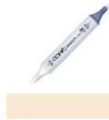
Copic Sketch Marker E31 BRICK BEIGE...