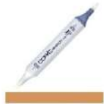
Copic Sketch Marker E37 SEPIA Brown...