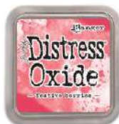
Tim Holtz Distress Oxide Ink Pad...