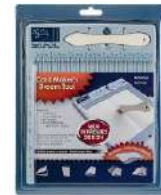
Scor-Pal MINI SCOR-BUDDY Scoring...