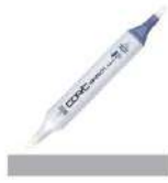
Copic Sketch Marker N5 NEUTRAL GRAY...