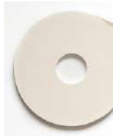
Simon Says Stamp BIG MOMMA FOAM TAPE...