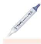
Copic Sketch Marker R30