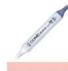
Copic Sketch Marker R32 PEACH at...