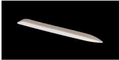
Simon Says Stamp SMALL TEFLON BONE...