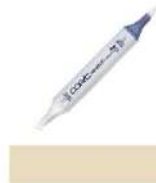
Copic Sketch MARKER E43 DULL IVORY...