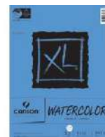
Canson XL WATERCOLOR