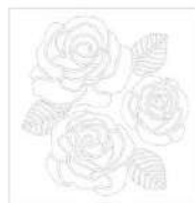
Simon Says Stamp Stencil

Here are the supplies used. Where available I use Compensated Affiliate Links , which means if you make a purchase through my link, I receive a small commission at no extra cost to you. Thank you so very much for your support, I truly appreciate it.