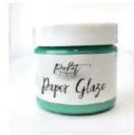
Picket Fence Studios SUCCULENT GREEN...