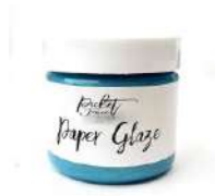
Picket Fence Studios OCEAN POPPY...