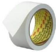
3M 2 INCH WIDE POST-IT TAPE 36 Yards...