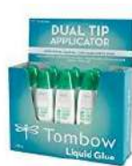
Amazon.com: Buying Choices: Tombow...