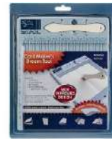
Scor-Pal MINI SCOR-BUDDY Scoring...