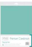
Therm O Web Gina K Designs TURQUOISE...