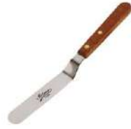
Dreamweaver PALETTE KNIFE Ateco 1385...