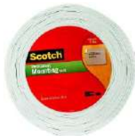
3M Scotch DOUBLE-SIDED FOAM TAPE...