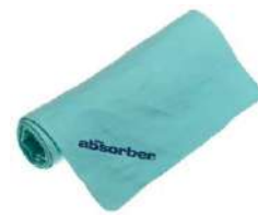
The AQUA Absorber Towel 17 x 27...