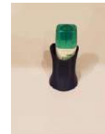
Amazon.com: Glue Holder for Tombow...