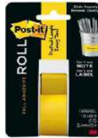
Amazon.com : Post-it Full Adhesive...