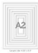
Simon Says Stamp A2 THIN FRAMES Wafer...