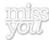
CZ Design Wafer Dies MISS YOU czd80...