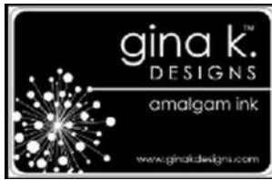
Gina K Designs OBSIDIAN Amalgam Ink...