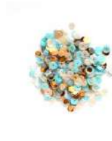
Simon Says Stamp Sequins SUNKEN...