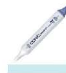
Copic Sketch Marker BG13 MINT GREEN...