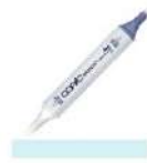
Copic Sketch Marker BG11 MOON WHITE...