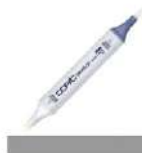
Copic Sketch Marker N6 NEUTRAL GRAY...