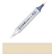
Copic Sketch MARKER E43 DULL IVORY...