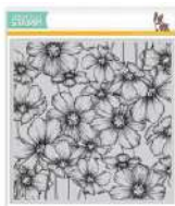
Simon Says Cling Rubber Stamp COSMOS...

Here are the supplies used. Where available I use Compensated Affiliate Links, which means if you make a purchase through my link, I receive a small commission at no extra cost to you. Thank you so very much for your support, I truly appreciate it.