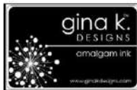
Gina K Designs OBSIDIAN Amalgam Ink...