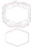
Honey Bee IN FULL BLOOM Dies hbds240