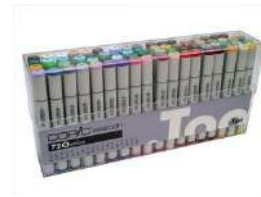
Copic SKETCH 72 PC SET B Markers BBBS72B