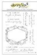
Honey Bee IN FULL BLOOM Clear Stamp...

Here are the supplies used. Where available I use Compensated Affiliate Links, which means if you make a purchase through my link, I receive a small commission at no extra cost to you. Thank you so very much for your support, I genuinely appreciate it.