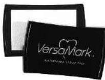
Tsukineko Versamark EMBOSS INK PAD...