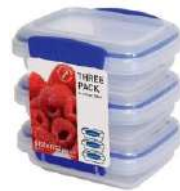
Sistema KLIP IT 3 Containers Clear...