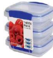
Sistema KLIP IT 3 Containers Clear...