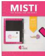
MISTI PRECISION STAMPER Stamping Tool...