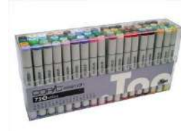
Copic SKETCH 72 PC SET B Markers BBBS72B