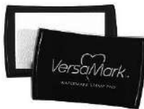
Tsukineko Versamark EMBOSS INK PAD...