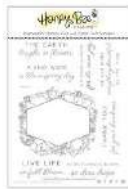
Honey Bee IN FULL BLOOM Clear Stamp...

PLEASE NOTE – this supply list is for both cards although not all products were used on both