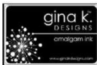
Gina K Designs OBSIDIAN Amalgam Ink...