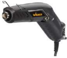
NEW 2020 Wagner Precision Heat Tool...