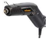
NEW 2020 Wagner Precision Heat Tool...