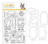
Simon Says Stamps and Dies CHILLIN...

Here are the supplies used. Where available I use Compensated Affiliate Links, which means if you make a purchase through my link, I receive a small commission at no extra cost to you. Thank you so very much for your support, I truly appreciate it.