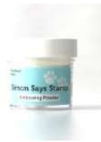
Simon Says Stamp EMBOSSING POWDER...