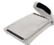
Tim Holtz Tonic GUILLOTINE