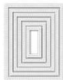
Simon Says Stamp STITCHED