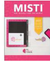
MISTI PRECISION STAMPER Stamping Tool...