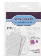
Scrapbook Adhesives 3D 217 WHITE FOAM...