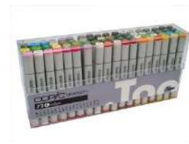
Copic SKETCH 72 PC SET C Markers...