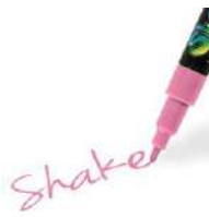
GRAPH'IT SHAKE Marker Fine 5125 -...