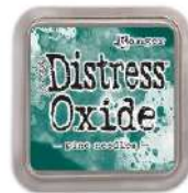
Tim Holtz Distress Oxide Ink Pad PINE...