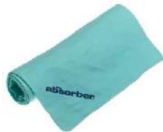
The AQUA Absorber Towel 17 x 27...