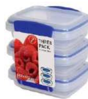
Sistema KLIP IT 3 Containers Clear...