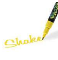
GRAPH'IT SHAKE Marker Fine 1170 -...