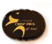
Altenew JET BLACK Crisp Dye Ink Pad...