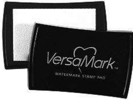
Tsukineko Versamark EMOSS INK PAD...