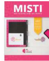
MISTI PRECISION STAMPER Stamping Tool...