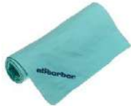
The AQUA Absorber Towel 17 x 27...