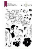
Altenew HANDPICKED BOUQUET Clear...