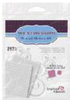
Scrapbook Adhesives THIN 3D 217 WHITE...