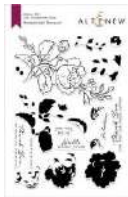
Handpicked Bouquet Stamp Set €€ Altenew