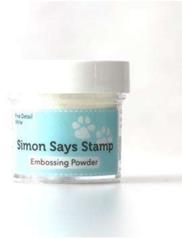
Simon Says Stamp EMOSSING POWDER...