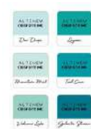
Cerulean Skies 6 Mini Cube Set €€ Altenew