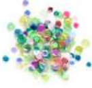
Simon Says Stamp Sequins FLOWERING...