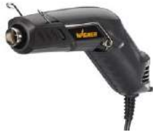
NEW 2020 Wagner Precision Heat Tool...