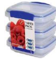
Sistema KLIP IT 3 Containers Clear...