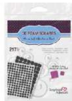
Scrapbook Adhesives 3D FOAM SQUARES...