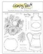
Honey Bee FARM FRESH FLOWERS Clear...

Here are the supplies used. Where available I use Compensated Affiliate Links, which means if you make a purchase through my link, I receive a small commission at no extra cost to you. Thank you so very much for your support, I genuinely appreciate it.