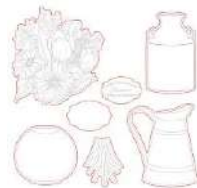
Honey Bee FARM FRESH FLOWERS Dies...