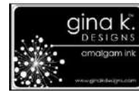
Gina K Designs OBSIDIAN Amalgam Ink...