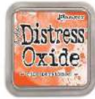
Ripe Persimmon, Ranger Distress Oxide...