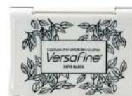
VersaFine Ink Pad, Onyx Black - Ellen...