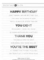
That Thing You Did, Essentials By...