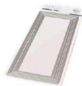
Essentials: Slim Stitched Rectangle,...