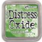
Mowed Lawn, Ranger Distress Oxide Ink...