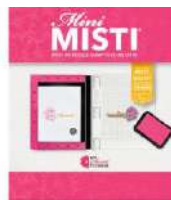
Mini MISTI Laser Etched Stamping Tool...