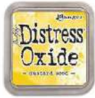
Mustard Seed, Ranger Distress Oxide...