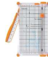
03441 Fiskars PREMIUM CUT LINE Paper...