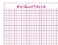
MISTI MOUSE PAD INSERT 000144