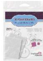
Scrapbook Adhesives 3D 217 WHITE FOAM...