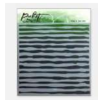
Picket Fence Studios WATERCOLOR BRUSH...