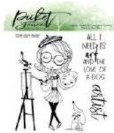
Picket Fence Studios ARTIST DEAR...

Here are the supplies used. Where available I use Compensated Affiliate Links, which means if you make a purchase through my link, I receive a small commission at no extra cost to you. Thank you so very much for your support, I genuinely appreciate it.