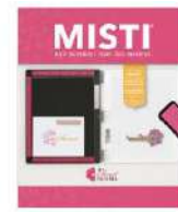
RESERVE MISTI PRECISION STAMPER...