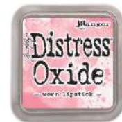
Tim Holtz Distress Oxide Ink Pad WORN...