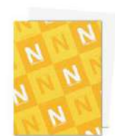
Neenah Classic Crest 80 LB REAM...