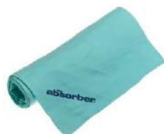
The AQUA Absorber Towel 17 x 27...