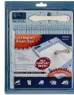
Scor-Pal MINI SCOR- BUDDY Scoring...