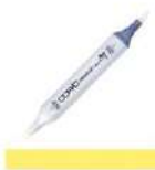
Copic Sketch MARKER Y15 CADMIUM...