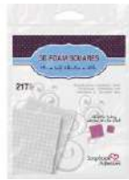
Scrapbook Adhesives 3D 217 WHITE FOAM...