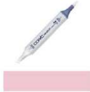
Copic Sketch Marker R81 ROSE PINK...