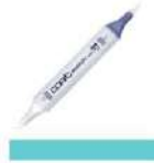
Copic Sketch Marker BG53 ICE MINT...