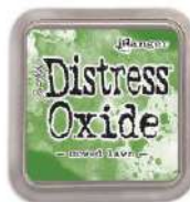
Tim Holtz Distress Oxide Ink