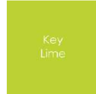
Heavy Base Weight Card Stock- Key...