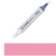
Copic Sketch Marker R83 ROSE MIST...