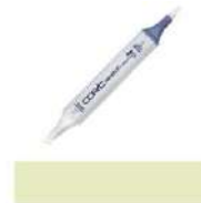
Copic Sketch Marker YG01 GREEN BICE...