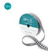
Gina K. Designs Gingham Fancy Ribbon...