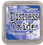
Tim Holtz Distress Oxide Ink Pad...