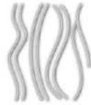
Simon Says Stamp STITCHED SLOPES AND...