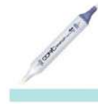
Copic Sketch Marker BG45 NILE BLUE at...