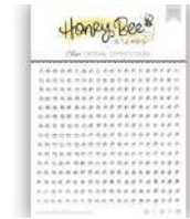
Honey Bee CRYSTAL CLEAR Gem Stickers...