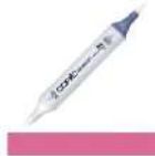
Copic Sketch Marker R85 ROSE RED...