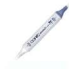
Copic Sketch Marker B0000 PALE...