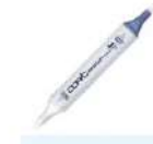
Copic Sketch Marker B00 FROST BLUE at...