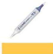
Copic Sketch MARKER YR14 CAMEL at...