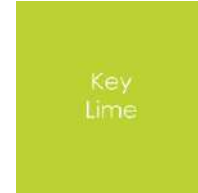
Heavy Base Weight Card Stock- Key...