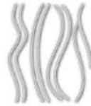
Simon Says Stamp STITCHED SLOPES AND...