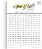
Honey Bee CRYSTAL CLEAR Gem Stickers...