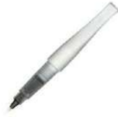
ZIG Wink of Stella GLITTER CLEAR...