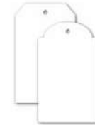
Simon Says Stamp LARGE TAGS Wafer...