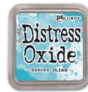
Tim Holtz Distress Oxide Ink Pad...