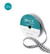
Gina K. Designs Gingham Fancy Ribbon...