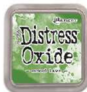
Tim Holtz Distress Oxide Ink Pad...