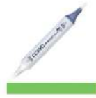
Copic Sketch Marker YG17 GRASS GREEN...