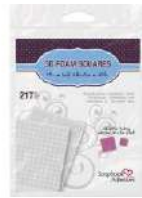
Scrapbook Adhesives 3D 217 WHITE FOAM...