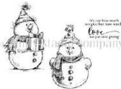
Sale - NEW STAMP arrivals! - Unity...

Here are the supplies used. Where available I use Compensated Affiliate Links, which means if you make a purchase through my link, I receive a small commission at no extra cost to you. Thank you so very much for your support, I genuinely appreciate it.