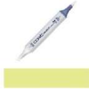
Copic Sketch Marker YG23 NEW LEAF...