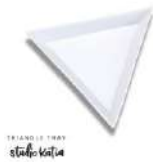
Studio Katia TRIANGLE TRAY sk2119 at...