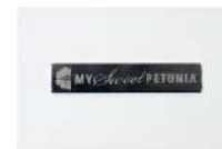
MISTI Neodymium BAR MAGNET 007070