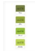
Altenew TROPICAL FOREST Mini Cube...