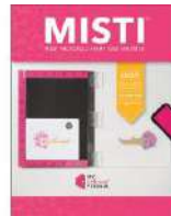
MISTI PRECISION STAMPER Stamping Tool...