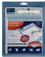
Scor-Pal MINI SCOR-BUDDY Scoring...