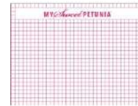
MISTI MOUSE PAD INSERT 000144