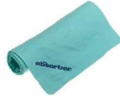
The AQUA Absorber Towel 17 x 27...