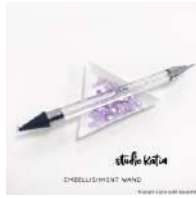
Studio Katia EMBELLISHMENT WAND sk014...