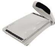
Tim Holtz Tonic GUILLOTINE COMFORT...