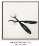
Ink Blender Brushes Set of 2, Studio...