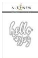
Halftone Hello Die Set