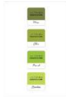
Altenew Crisp Dye Ink Cubes, Tropical...