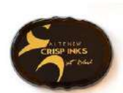
Altenew JET BLACK Crisp Dye Ink Pad...