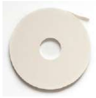
Simon Says Stamp BIG MOMMA FOAM TAPE...