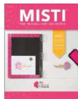
MISTI PRECISION STAMPER Stamping Tool...