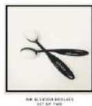
Ink Blender Brushes Set of 2, Studio...