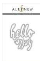
Halftone Hello Die Set