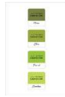
Altenew TROPICAL FOREST Mini Cube...