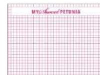
MISTI MOUSE PAD INSERT 000144