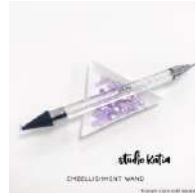
Studio Katia EMBELLISHMENT WAND sk014...