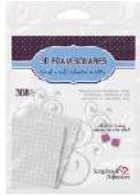
Scrapbook Adhesives 1/4 INCH 3D 308...