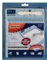
Scor-Pal MINI SCOR-BUDDY Scoring...