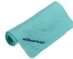
The AQUA Absorber Towel 17 x 27...