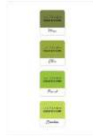
Altenew Crisp Dye Ink Cubes, Tropical...