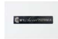
MISTI Neodymium BAR MAGNET 007070