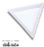
Studio Katia TRIANGLE TRAY sk2119 at...