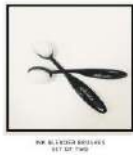
Ink Blender Brushes Set of 2, Studio...