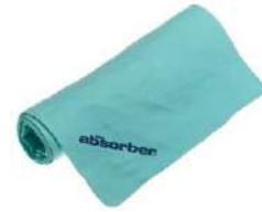
The AQUA Absorber Towel 17 x 27...