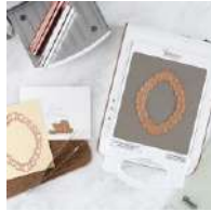
Glimmer Hot Foil System - Spellbinders