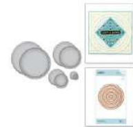
Nestabilities Essential Circles...