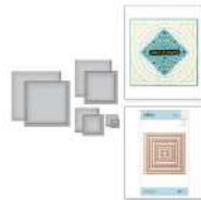
Nestabilities Essential Squares...