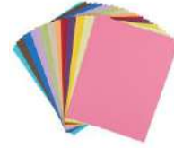
Assorted Cardstock Pack (24 sheets)