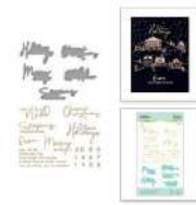
Yana's Christmas Sentiments Glimmer...