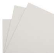
Color Splash Watercolor Sheets