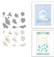
Christmas Organic Foliage Glimmer Hot...