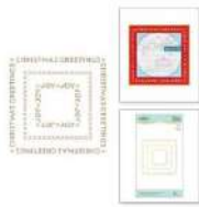
Christmas Essential Glimmer Squares...

Here are the supplies used. Where available I use Compensated Affiliate Links, which means if you make a purchase through my link, I receive a small commission at no extra cost to you. Thank you so very much for your support, I genuinely appreciate it.