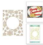
Snowflake Sparkle Background Glimmer...