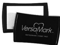
Tsukineko Versamark EMBOSS INK PAD...