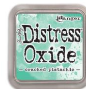
Tim Holtz Distress Oxide