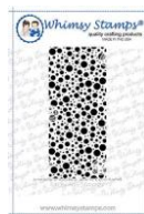
Lots of Dots Background Rubber Cling...