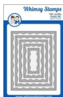
Zig Zag Stitched Rectangles