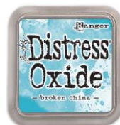
Tim Holtz Distress Oxide Ink