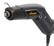
NEW 2020 Wagner Precision Heat Tool...