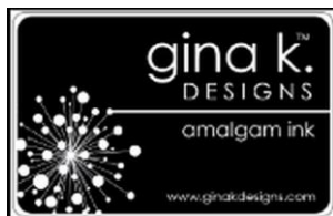
Gina K Designs OBSIDIAN Amalgam Ink...