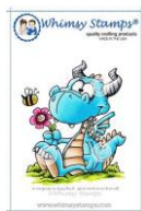
Dorky Dragon Rubber Cling Stamp | ...

Here are the supplies used. Where available I use Compensated Affiliate Links, which means if you make a purchase through my link, I receive a small commission at no extra cost to you. Thank you so very much for your support, I genuinely appreciate it.