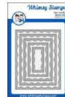
Zig Zag Stitched Rectangles Die Set |...