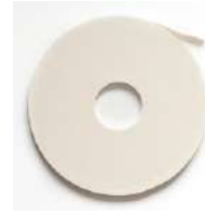
Simon Says Stamp BIG MOMMA FOAM TAPE...