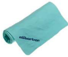
The AQUA Absorber Towel 17 x 27...