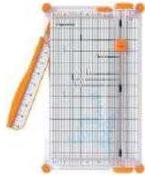
03441 Fiskars PREMIUM CUT LINE Paper...