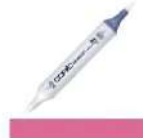
Copic Sketch Marker R85 ROSE RED...