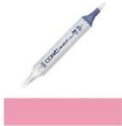
Copic Sketch Marker R83 ROSE MIST...