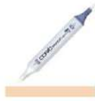
Copic Sketch MARKER E33 SAND Beige at...