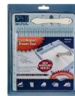
Scor-Pal MINI SCOR-BUDDY Scoring...