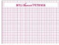
MISTI MOUSE PAD INSERT 000144