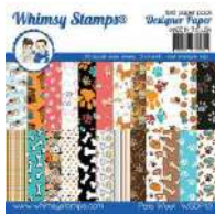
6x6 Paper Pack - Pets Wool | Whimsy...