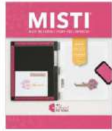
MISTI PRECISION STAMPER Stamping Tool...