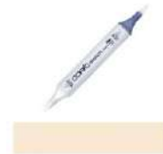
Copic Sketch Marker E31 BRICK BEIGE...