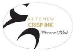
Altenew PERMANENT BLACK Crisp Dye Ink...