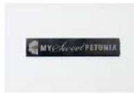
MISTI Neodymium BAR MAGNET 007070