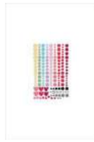
New Day Card Kit Enamel Dots " Altenew