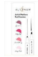
Artist Markers Red Cosmos Set " Altenew