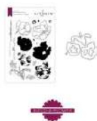
Altenew BUILD A FLOWER POPPY Clear...

Here are the supplies used. Where available I use Compensated Affiliate Links, which means if you make a purchase through my link, I receive a small commission at no extra cost to you. Thank you so very much for your support, I genuinely appreciate it.