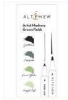
Artist Markers Green Fields Set "...