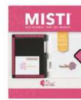
MISTI PRECISION STAMPER VERSION 2.0...