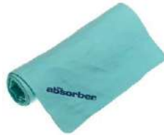
The AQUA Absorber Towel 17 x 27...