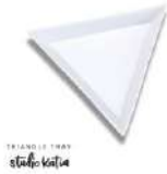
Studio Katia TRIANGLE TRAY sk2119 at...