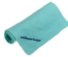
The AQUA Absorber Towel 17 x 27...