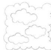
Simon Says Stamp Stencils CLOUDS FOR...