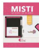
MISTI PRECISION STAMPER VERSION 2.0...