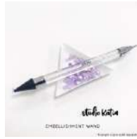
Studio Katia EMBELLISHMENT WAND sk014...