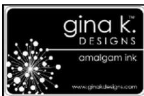
Gina K Designs OBSIDIAN Amalgam Ink...