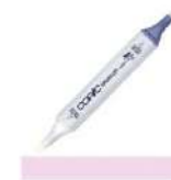
Copic Sketch Marker V12 PALE LILAC...