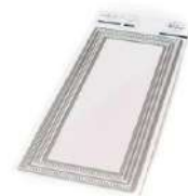
PinkFresh Studio SLIM DIAGONAL...