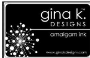
Gina K Designs OBSIDIAN Amalgam Ink...