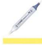
Copic Sketch MARKER Y15 CADMIUM...