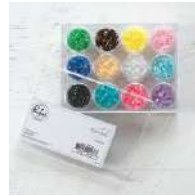
PinkFresh Studio JEWELS MIX...