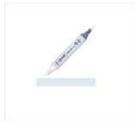
Copic Sketch Marker C1 COOL GRAY Grey...