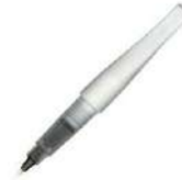
ZIG Wink of Stella GLITTER CLEAR...