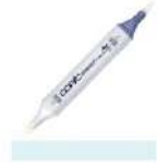
Copic Sketch Marker B01 MINT BLUE at...