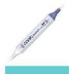
Copic Sketch Marker BG53 ICE MINT...