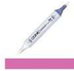
Copic Sketch Marker RV17 DEEP MAGENTA...