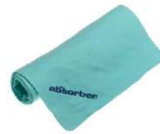
The AQUA Absorber Towel 17 x 27...