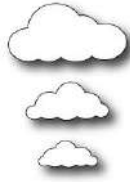
Memory Box PUFFY CLOUDS Craft Die...