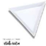
Studio Katia TRIANGLE TRAY sk2119 at...