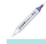
Copic Sketch Marker BG45 NILE BLUE at...