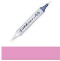
copic marker RV63 at Simon Says STAMP!