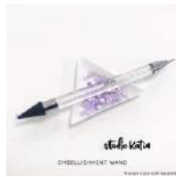
Studio Katia EMBELLISHMENT WAND sk014...