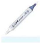
Copic Sketch Marker B00 FROST BLUE at...