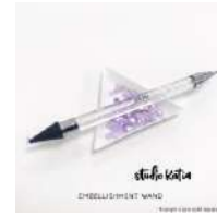
Studio Katia EMBELLISHMENT WAND sk014...