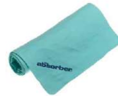
The AQUA Absorber Towel 17 x 27...