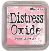
Tim Holtz Distress Oxide Ink Pad WORN...