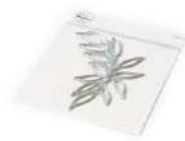
Leafy branch die "Pinkfresh Studio"