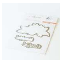
Celebrate us die set “ Pinkfresh Studio