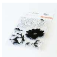
Celebrate us stamp set “ Pinkfresh...

Here are the supplies used. Where available I use Compensated Affiliate Links, which means if you make a purchase through my link, I receive a small commission at no extra cost to you. Thank you so very much for your support, I genuinely appreciate it.