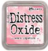
Tim Holtz Distress Oxide Ink Pad WORN...