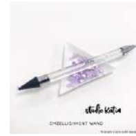
Studio Katia EMBELLISHMENT WAND sk014...