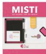
MISTI Precision Stamper Version 2.0...