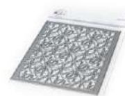
Geo Floral Background | Flower...