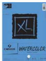
Canson XL WATERCOLOR PAPER 9x12 140lb...