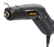
NEW 2020 Wagner Precision Heat Tool...