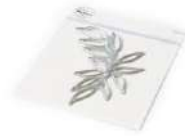
Leafy branch die "Pinkfresh Studio"