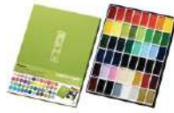
Zig Kuretake Gansai Tambi 48 COLOR...