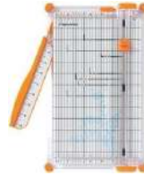
03441 Fiskars PREMIUM CUT LINE Paper...