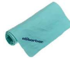
The AQUA Absorber Towel 17 x 27...