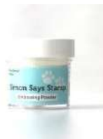
Simon Says Stamp EMBOSSING POWDER...