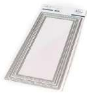
Slim diagonal stitched rectangles die...