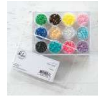
Essentials: Jewels Mix "Pinkfresh..."