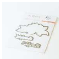
Celebrate us die set â€“ Pinkfresh Studio