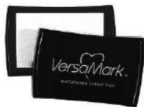
Tsukineko Versamark EMBOSS INK PAD...