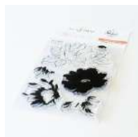
Celebrate us stamp set â€“ Pinkfresh...

Here are the supplies used. Where available I use Compensated Affiliate Links, which means if you make a purchase through my link, I receive a small commission at no extra cost to you. Thank you so very much for your support, I genuinely appreciate it.