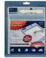
Scor-Pal MINI SCOR-BUDDY Scoring...