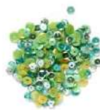
Simon Says Stamp Sequins SPRING GREEN...