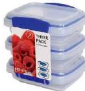
Sistema KLIP IT 3 Containers Clear...