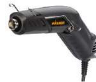
NEW 2020 Wagner Precision Heat Tool...