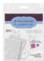
Scrapbook Adhesives 3D 217 WHITE FOAM...