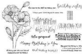
Aging Gorgeously {July 2020 sentiment...