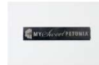
MISTI Neodymium BAR MAGNET 007070