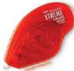
Tombow XTREME Permanent Adhesive Tape...