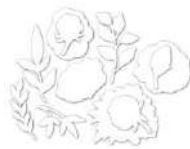
Simon Says Stamp DELICATE FLOWERS...