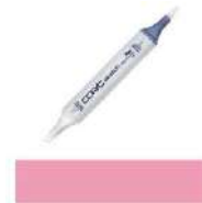
Copic Sketch Marker R83 ROSE MIST...