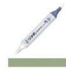
Copic Sketch Marker G94 GRAYISH OLIVE...