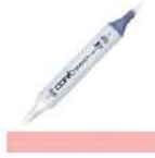
Copic Sketch Marker RV34 DARK PINK