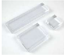
Hero Arts Rubber Stamp SMALL BLOCK...