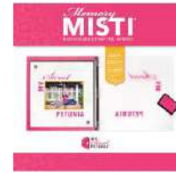
MISTI MEMORY MISTI PRECISION STAMPER...