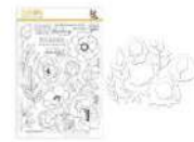
Simon Says Stamps and Dies DELICATE...