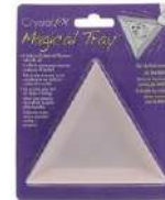
Beadsmith MAGICAL TRAY For...