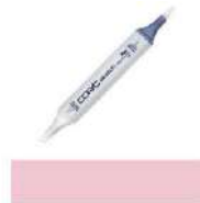
Copic Sketch Marker R81 ROSE PINK Pastel