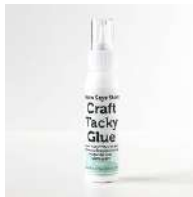
Simon Says Stamp CRAFT TACKY GLUE...