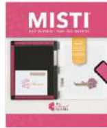
MISTI PRECISION STAMPER VERSION 2.0...