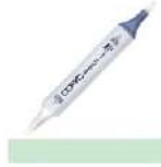
Copic Sketch MARKER G21 LIME GREEN