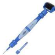
Tool 'n One