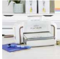
PL-001 Platinum Die Cutting and...