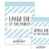
Die Hard Value Club Membership -...