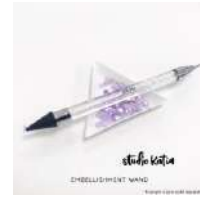
Studio Katia EMBELLISHMENT WAND sk014...