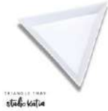
Studio Katia TRIANGLE TRAY sk2119 at...