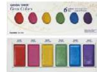
Zig Kuretake Gansai Tambi GEM COLORS...