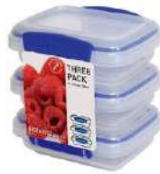
Sistema KLIP IT 3 Containers Clear...