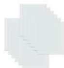
Simon Says Stamp VELLUM SSSVEL12 at...