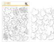
Simon Says Stamps and Dies AUTUMN...