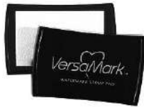
Tsukineko Versamark EMBOSS INK PAD...