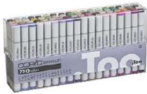
Copic SKETCH 72 PC SET E Markers...