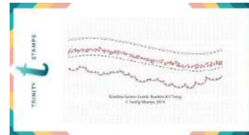
(1) Slimline Card Series: Scenic...