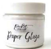
Picket Fence Studios