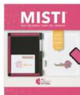
MISTI PRECISION STAMPER Stamping Tool...