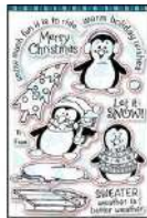
Penguin Fun Stamp Set - Dare 2b Artzy