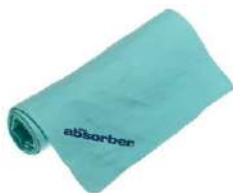
The AQUA Absorber Towel 17 x 27...