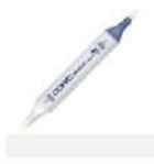
Copic Sketch Marker T0 TONER GRAY at...