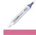
Copic Sketch Marker R85 ROSE RED...