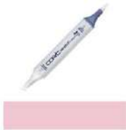
Copic Sketch Marker R81 ROSE PINK...