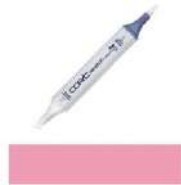
Copic Sketch Marker R83 ROSE MIST...