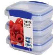
Sistema KLIP IT 3 Containers Clear...