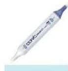
Copic Sketch Marker BG13 MINT GREEN...