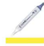
Copic Sketch Marker Y19 NAPOLI YELLOW...