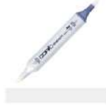
Copic Sketch Marker T1 TONER GRAY at...