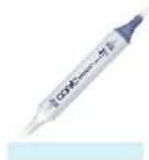
Copic Sketch Marker BG11 MOON WHITE...