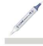
Copic Sketch Marker T3 TONER GRAY at...