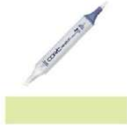
Copic Sketch Marker YG03 YELLOW GREEN...