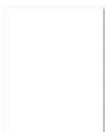
neenah 80 lb at Simon Says STAMP!