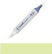
Copic Sketch Marker YG03 YELLOW GREEN...