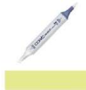
Copic Sketch Marker YG23 NEW LEAF...