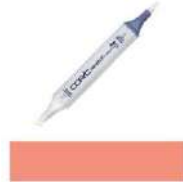
Copic Sketch Marker R05 SALMON RED...