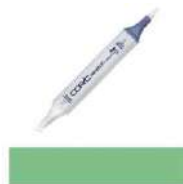
Copic Sketch Marker YG67 MOSS Dark...