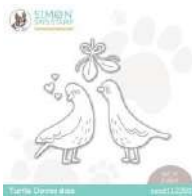
Simon Says Stamp TURTLE DOVES Wafer...

Please note this list contains products for both cards shared today