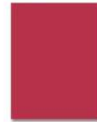
Simon Says Stamp Card Stock 100#...