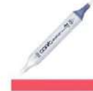
Copic Sketch MARKER R27 CADMIUM RED...