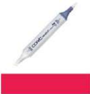
Copic Sketch Marker R29 LIPSTICK RED...