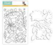
Simon Says Stamps And Dies WINTER...