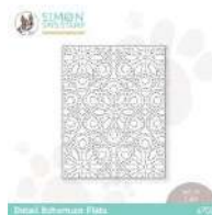
Simon Says Stamp DETAIL BOHEMIAN...