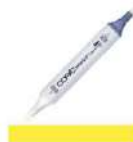
Copic Sketch Marker Y19 NAPOLI YELLOW...