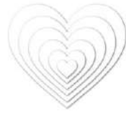
Simon Says Stamp NESTED HEARTS Wafer...