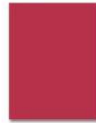
Simon Says Stamp Card Stock 100#...