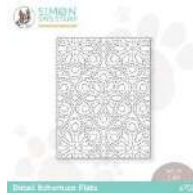
Simon Says Stamp DETAIL BOHEMIAN...