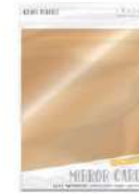
Tonic HARVEST GOLD Mirror Card Gloss...