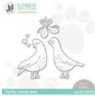
Simon Says Stamp TURTLE DOVES Wafer...

Please note that this list contains the products for both cards shared today