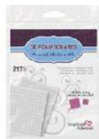
Scrapbook Adhesives 3D 217 WHITE FOAM...