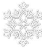
Simon Says Stamp SOPHIE SNOWFLAKE...