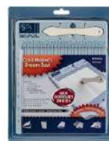
Scor-Pal MINI SCOR-BUDDY