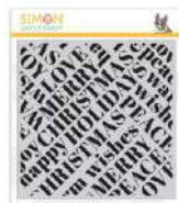
Simon Says Cling Stamp HOLIDAY WORDS...