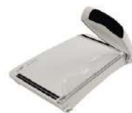
Tim Holtz Tonic GUILLOTINE COMFORT...