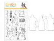
Simon Says Stamps and Dies SPRING...