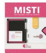
MISTI PRECISION STAMPER Stamping