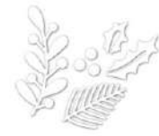
Simon Says Stamp CHRISTMAS FOLIAGE...