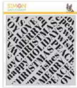
Simon Says Cling Stamp HOLIDAY WORDS...