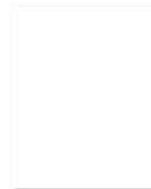
neenah 80 lb at Simon Says STAMP!