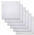
Simon Says Stamp Cardstock WHITE...