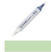
Copic Sketch MARKER G24 WILLOW Green...