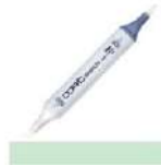
Copic Sketch MARKER G21 LIME GREEN at...