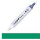
Copic Sketch MARKER G28 OCEAN GREEN...