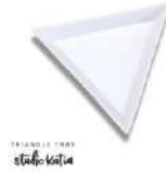
Studio Katia TRIANGLE TRAY sk2119 at...