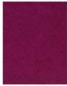
Bazzill MULBERRY Card Shope Heavy...