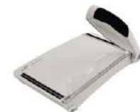
Tim Holtz Tonic GUILLOTINE COMFORT...