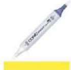
Copic Sketch Marker Y19 NAPOLI YELLOW...