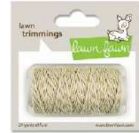
Lawn Fawn GOLD SPARKLE Single Cord...