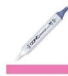
Copic Sketch Marker RV55 HOLLYHOCK...