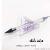
Studio Katia EMBELLISHMENT WAND sk014...