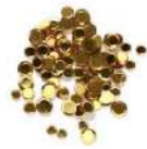
Simon Says Stamp Sequins STAY GOLD...