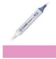
Copic Sketch Marker RV63 BEGONIA Pink...