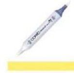
Copic Sketch MARKER Y15 CADMIUM...