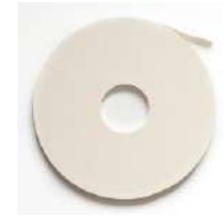
Simon Says Stamp BIG MOMMA FOAM TAPE...