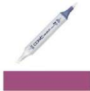
Copic Sketch Marker RV66 RASPBERRY...