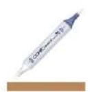
Copic Sketch Marker E57 LIGHT WALNUT...