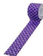
Therm O Web 0.5 INCH PURPLE TAPE Easy...