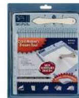
Scor-Pal MINI SCOR-BUDDY Scoring...