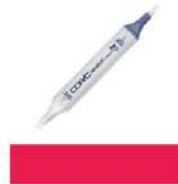
Copic Sketch Marker R29 LIPSTICK RED...