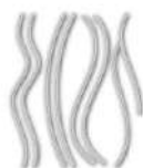
Simon Says Stamp STITCHED SLOPES AND...