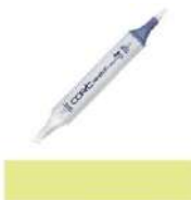
Copic Sketch Marker YG23 NEW LEAF...