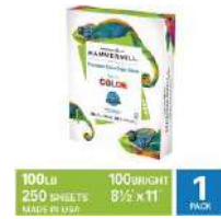
Amazon.com: Hammermill Premium Color...