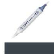
Copic Sketch MARKER C9 COOL GRAY Grey...