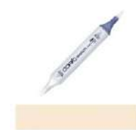
Copic Sketch Marker E31 BRICK BEIGE...