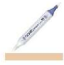
Copic Sketch Marker E35 CHAMOIS Light...