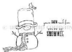
Snowmie - Unity Stamp Company

Here are the supplies used for this project. Affiliate links used where possible at no additional cost to you: