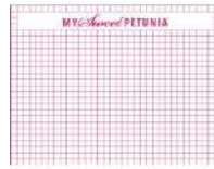
MISTI MOUSE PAD INSERT 000144