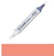
Copic Sketch Marker R05 SALMON RED...