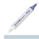
Copic Sketch MARKER C3 COOL GRAY Grey...