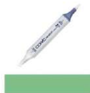
Copic Sketch Marker YG67 MOSS Dark...