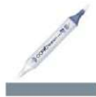
Copic Sketch MARKER C6 COOL GRAY NO....