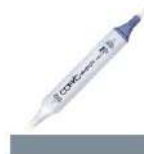
Copic Sketch MARKER C7 COOL GRAY Grey...