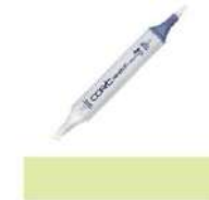
Copic Sketch Marker YG03 YELLOW GREEN...