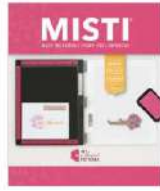
MISTI PRECISION STAMPER Stamping Tool...