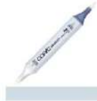
Copic Sketch MARKER C2 COOL GRAY NO. 2