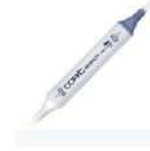
Copic Sketch Marker C00 COOL GRAY at...