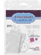
Scrapbook Adhesives 3D 217 WHITE FOAM...