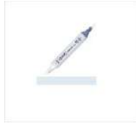
Copic Sketch Marker C1 COOL GRAY Grey