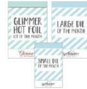
Glimmer 'n Cut Value Club Membership...