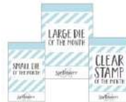
Die & Stamp Addict Club Membership -...