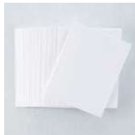
A2 White Card Bases - Top Fold - 25 pack