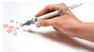
We R Memory Keepers QUICKSTIK...