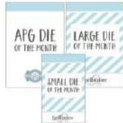
Die Hero Value Club Membership -...