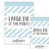
Die Hard Value Club Membership -...