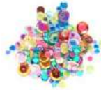
Simon Says Stamp Sequins HOLOGRAPHIC...