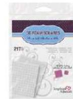
Scrapbook Adhesives 3D 217 WHITE FOAM...