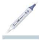
Copic Sketch MARKER C3 COOL GRAY Grey...