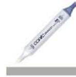
Copic Sketch Marker W5 WARM GRAY NO.5...