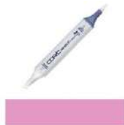
Copic Sketch Marker RV63 BEGONIA Pink...