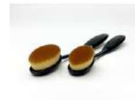
Picket Fence Studios LIFE CHANGING...