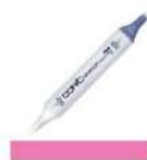
Copic Sketch Marker RV55 HOLLYHOCK...