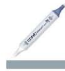
Copic Sketch MARKER C5 COOL GRAY Grey...