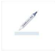
Copic Sketch Marker C1 COOL GRAY Grey...