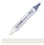
Copic Sketch Marker W1 WARM GRAY No...