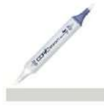
Copic Sketch MARKER W3 WARM GRAY Grey...