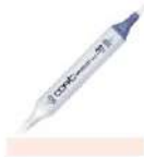
Copic Sketch Marker R30 PALE...