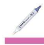
Copic Sketch Marker RV17 DEEP MAGENTA...