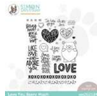
Simon Says Clear Stamps LOVE YOU...