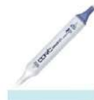
Copic Sketch Marker BG13 MINT GREEN...