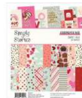
Simple Stories SWEET TALK 6 x 8 Paper...