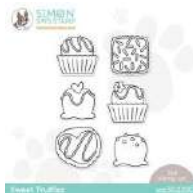
Simon Says Clear Stamps SWEET...