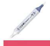
Copic Sketch Marker R46 STRONG RED...