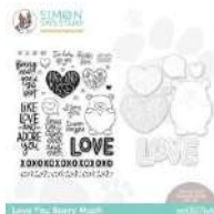
Simon Says Stamps and Dies LOVE YOU...