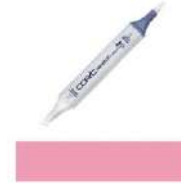
Copic Sketch Marker R83 ROSE MIST...