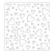
Simon Says Stamp Stencil TUMBLING...