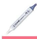
Copic Sketch Marker R35 CORAL at...