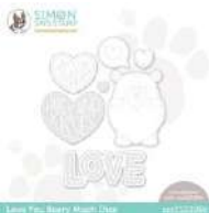
Simon Says Stamp LOVE YOU BEARY MUCH...