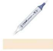
Copic Sketch Marker E31 BRICK BEIGE...