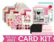
Simon Says Stamp Card Kit of the...