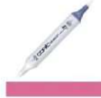
Copic Sketch Marker R85 ROSE RED...