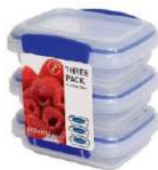
Sistema KLIP IT 3 Containers Clear...