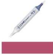
Copic Sketch Marker R59 CARDINAL...