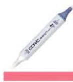
Copic Sketch Marker R35 CORAL at...