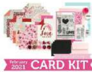
Simon Says Stamp Card Kit of the...