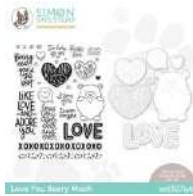
Simon Says Stamps and Dies LOVE YOU...