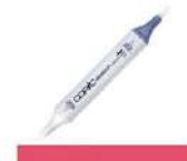
Copic Sketch Marker R46 STRONG RED...