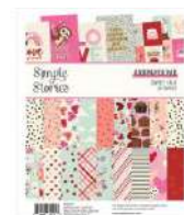
Simple Stories SWEET TALK 6 x 8 Paper...