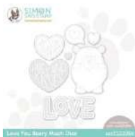
Simon Says Stamp LOVE YOU BEARY MUCH...