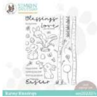
Simon Says Clear Stamps BUNNY...