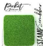
Picket Fence Studios THE STAMP...