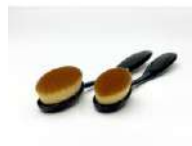
Picket Fence Studios LIFE CHANGING...