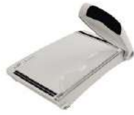
Tim Holtz Tonic GUILLOTINE COMFORT...