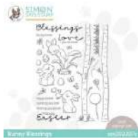
Simon Says Clear Stamps BUNNY...