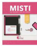
MISTI PRECISION STAMPER Stamping Tool...