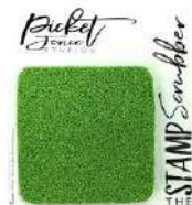
Picket Fence Studios THE STAMP...