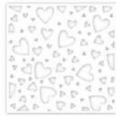
Simon Says Stamp Stencil TUMBLING...