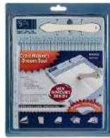
Scor-Pal MINI SCOR-BUDDY Scoring...