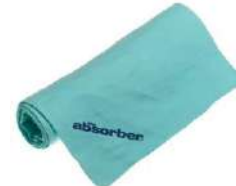
The AQUA Absorber Towel 17 x 27...