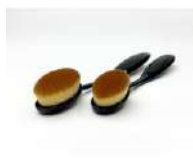
Picket Fence Studios LIFE CHANGING...