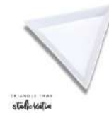
Studio Katia TRIANGLE TRAY sk2119 at...