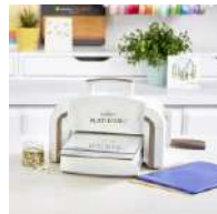
Platinum 6 Die Cutting and Embossing...