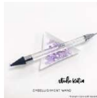
Studio Katia EMBELLISHMENT WAND sk014...