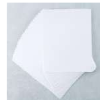
White Cardstock 8 1/2" x 11 - 25 pack