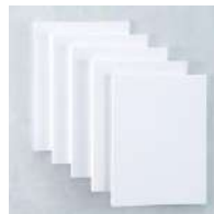
A7 White Card Bases -Side Fold - 25 pack