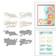
Heart Melt Sentiments Glimmer Hot...