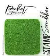
Picket Fence Studios THE STAMP...