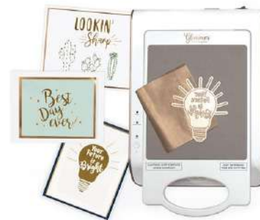
GLS-001 Spellbinders GLIMMER HOT FOIL...