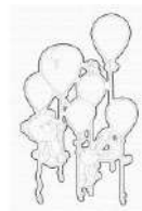
My Favorite Things SWEET CELEBRATION...