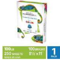
Amazon.com: Hammermill Premium Color...