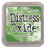
Tim Holtz Distress Oxide Ink Pad...