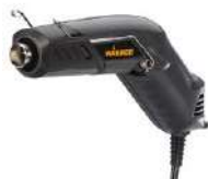
Popular Wagner Precision Heat Tool HT400