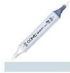
Copic Sketch MARKER C2 COOL GRAY NO. 2