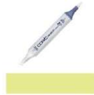
Copic Sketch Marker YG23 NEW LEAF...