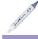
Copic Sketch Marker V17 AMETHYST...