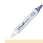
Copic Sketch Marker E53 RAW SILK...