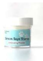
Simon Says Stamp EMBOSING POWDER...