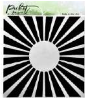
Picket Fence Studios BURST OF SUN 6x6...