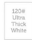
Simon Says Stamp WHITE CARDSTOCK 120...