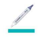
Copic Sketch Marker BG49 DUCK BLUE at...