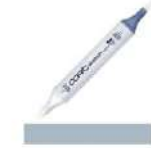
Copic Sketch MARKER C4 COOL GRAY NO....