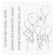
My Favorite Things SWEET CELEBRATION...