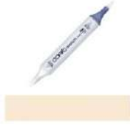
Copic Sketch Marker E31 BRICK BEIGE...