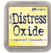
Tim Holtz Distress Oxide Ink Pad...