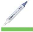
Copic Sketch Marker YG17 GRASS GREEN...