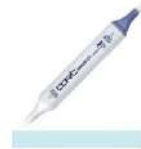
Copic Sketch Marker BG13 MINT GREEN...