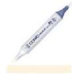
Copic Sketch Marker E51 MILKY WHITE...