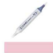
Copic Sketch Marker R81 ROSE PINK...