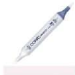
Copic Sketch Marker E50 EGG SHELL...