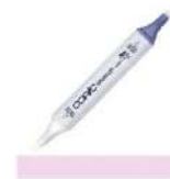
Copic Sketch Marker V12 PALE LILAC...