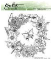
Beautiful Girls Flower Wreath â€“...