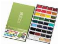
Kuretaka Gansai Tambi Traditional...