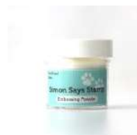
Simon Says Stamp EMBOSSING