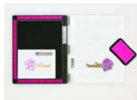
Original MISTI Version 2.0 â€“ Picket...