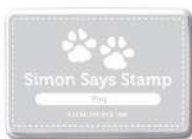
Simon Says Stamp Premium