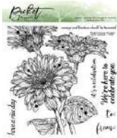
Wild Daisies â€” Picket Fence Studios