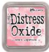
Tim Holtz Distress Oxide Ink Pad WORN...