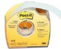
Scotch 3M POST-IT MASKING Labeling...