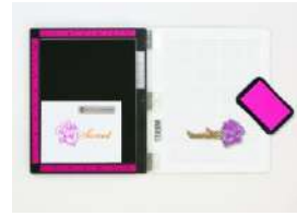
Original MISTI Version 2.0 " Picket...