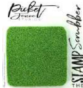
The Stamp Scrubber " Picket Fence...