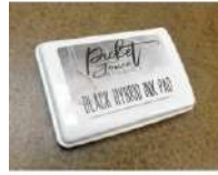
Black Hybrid Ink Pad " Picket Fence...