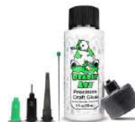
Bearly Art THE MINI Precision Craft...