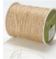
May Arts NATURAL Twine String Burlap...