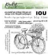
I'll Always Pick You " Picket Fence...