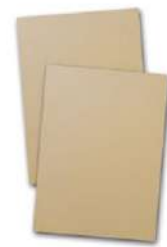
Neenah Environment 100 LB SMOOTH...