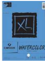
Canson XL WATERCOLOR PAPER 9x12 140lb...