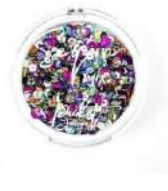
Sequin Mix - City of Lights " Picket...