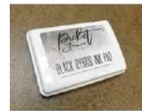
Black Hybrid Ink Pad " Picket Fence...