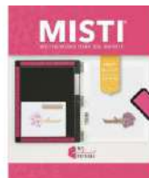
New & Improved MISTI Laser Etched...