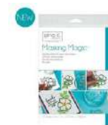
Masking Magic Sheets, Gina K Designs...