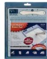
Scor-Buddy Mini Scoring Board 9x7.5 -...