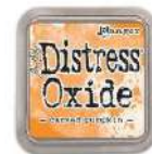
Carved Pumpkin, Ranger Distress Oxide...