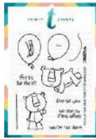
Trinity Stamps YOU LIFT ME UP Clear...