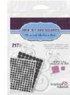
Scrapbook Adhesives THIN 3D ADHESIVE...