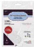
Scrapbook Adhesives MICRO WHITE 3D...