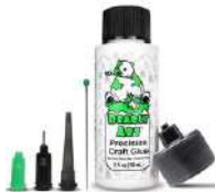
Bearly Art THE MINI Precision Craft...