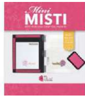
MINI MISTI PRECISION STAMPER VERSION...