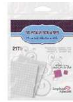
Scrapbook Adhesives 3D 217 WHITE FOAM...