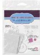
Scrapbook Adhesives THIN 3D 217 WHITE...